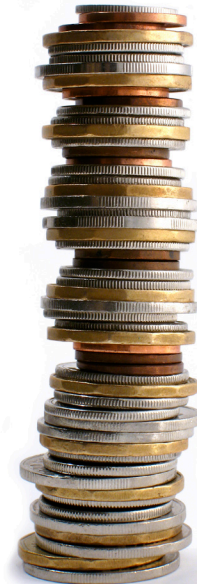
Percentage Distribution of Individual Income Ontario and Halton, 2005

Residents in the Town of Milton had the highest median income of $37,430 followed closely by those in the Town of Halton Hills at $36,520 and the Town of Oakville at $36,100. The median individual income for the City of Burlington is $34,800 which is about 93% of that of the Town of Milton.